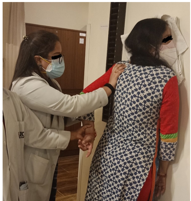
Fig: Glide is given to the patient to improve rotational range

Caudal glides &TENS & Ultrasound therapy combination therapy 5minutes