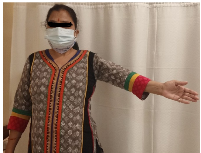
Fig: Rom before tissue flossing