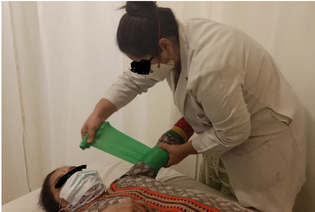
Fig: Doing tissue flossing on deltoid muscles.