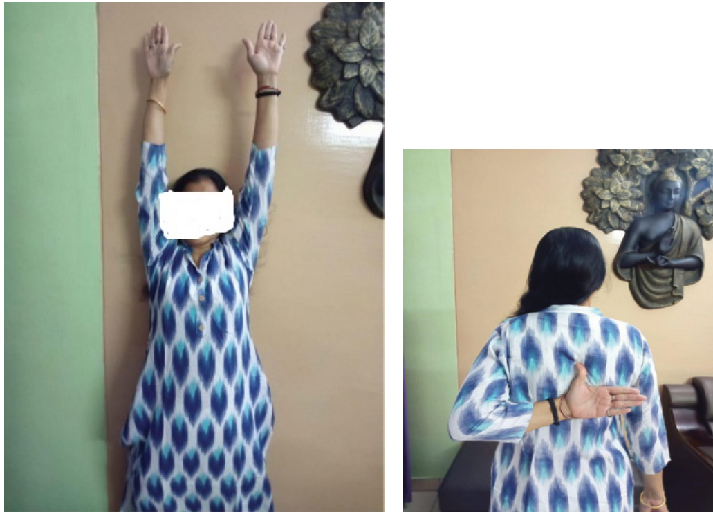
Fig: ROM on the last day of treatment.